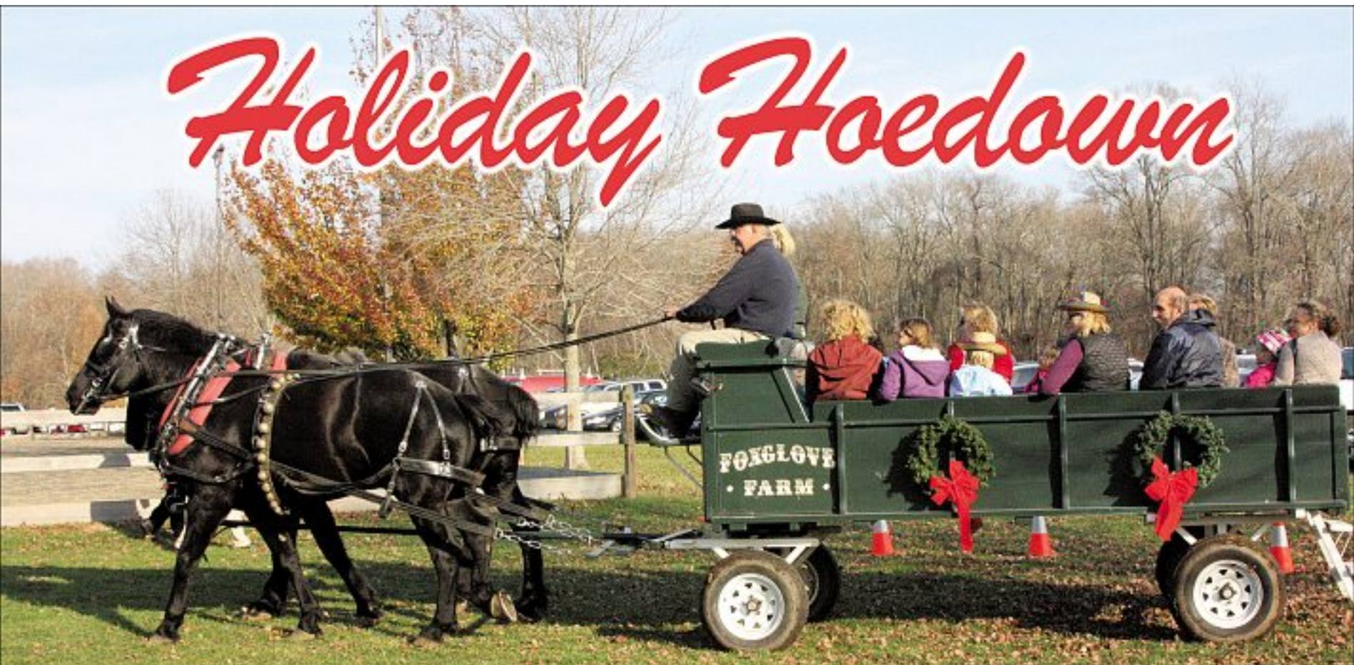
Above, wagon rides provided by Foxglove Farm, proved a favorite activity at the holiday market and hoedown.